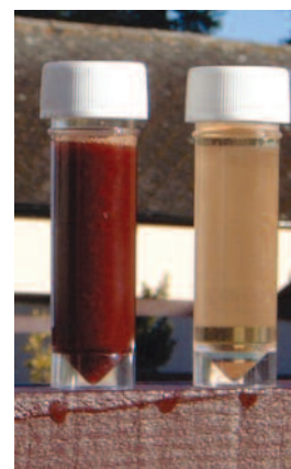
Fig. 3: Urine on left from a horse with post-exercise muscle damage. Normal urine on right.

horses with muscle damage. Tying up (often referred to as 'Monday Morning Disease' or 'Exertional Rhabdomyolysis'), the result of exercise-induced muscle injury,