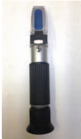
Fig. 6: Refractometer