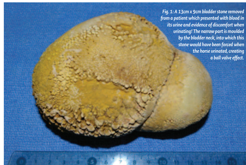
Fig. 1: A 13cm x 9cm bladder stone removed from a patient which presented with blood in its urine and evidence of discomfort when urinating! The narrow part is moulded by the bladder neck, into which this stone would have been forced when the horse urinated, creating a ball valve effect.

Direct visual observation of a urine sample is the first part of urinalysis. Excessive cellular material, excess protein or crystals may cause cloudiness. Discolouration of the urine can provide useful clues to the likely problem; red urine due to the presence of blood (haematuria) is most commonly associated with urolithiasis (crystals or stones, as mentioned above), urinary tract infections (e.g. cystitis), drug toxicity and neoplasia (cancerous growths) and less frequently with tears in the urethra (the tube that connects the bladder to the outside). The appearance of abnormal pigments can also cause marked discolouration of the urine; this is most frequently associated in