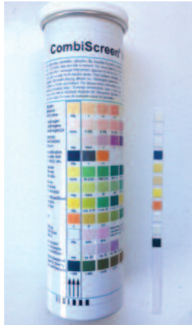
Fig. 5: Dipsticks