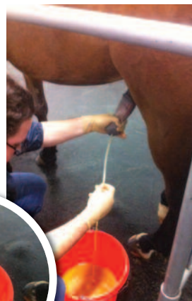
Fig. 2: Urinary catheterisation of a sedated gelding

Urinalysis is a relatively simple, cheap and useful diagnostic test that can be used to check for a variety of conditions. Many substances circulating in the blood eventually make their way into the urine, where they may be detected. Like human athletes, performance-enhancing drugs may also be detected in the urine. If you need to collect a urine sample for testing, a mid-stream sample, in a clean container, is best, but any sample collected this way will be of limited value when looking for bacterial infection as it is usually contaminated on its way out of the body. Urinary tract catheterisation ( Fig. 2 ) provides a more representative, uncontaminated sample but requires sedation in most cases. Ideally the sample should be examined within about 20-30 minutes of collection or be chilled to avoid changes that may alter