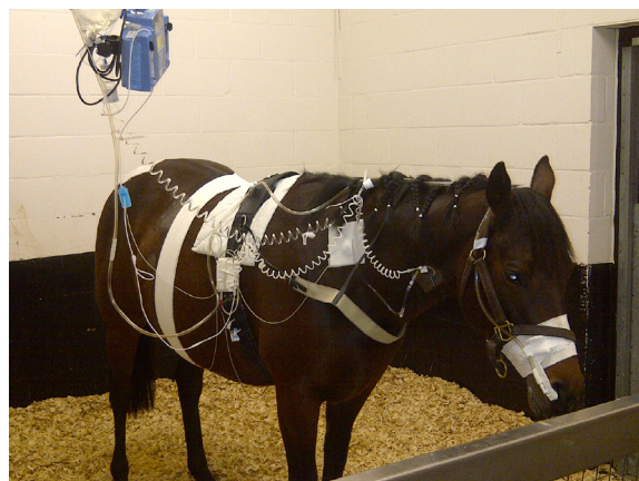
Fig 3. A mare receiving intravenous fluid nutrition and intranasal oxygen. An ECG has been attached to the mare with a surcingle so that her heart function can be monitored.

Following severe haemorrhage, significant compromise can occur to other body systems because of circulatory failure, disruption of blood flow to vital organs and lack of oxygen in the tissues. The heart and kidneys are particularly at risk and these mares may need a high level of intensive care in order to get over these sorts of multi-system problems.