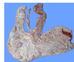
Complete fetal membranes

The mare may get up and down to move the foal into position. If safe to do so, feel the front feet in the birth canal. Once visible, peel the membranes off the nose.