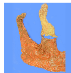
Incomplete fetal membranes (retained horn)

Tie up the fetal membranes carefully; it should all come out in one piece within 2 hours of the foal arriving. The mare might be a little uncomfortable but should stand within an hour.